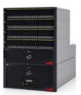
ETERNUS DX900 S5 Mid-range scale-out